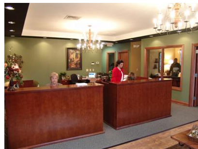
Surgery Center, Centerville, OH