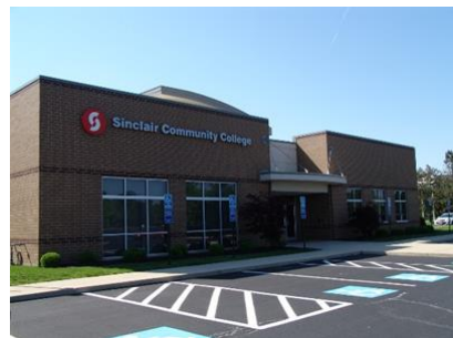
Community College, Mason, OH