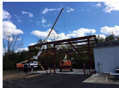
Industrial, Miamisburg, OH