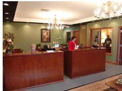
Surgery Center, Centerville, OH