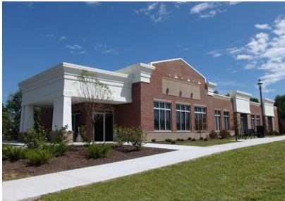
Medical Office Building, Union, KY