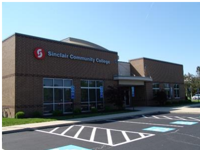
Community College, Mason, OH