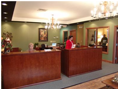
Surgery Center, Centerville, OH